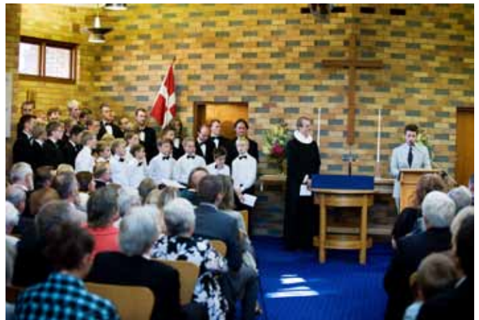
Crown Prince Frederik names the Church. Thisted Boys’ and Men’s Choir sang at the event.