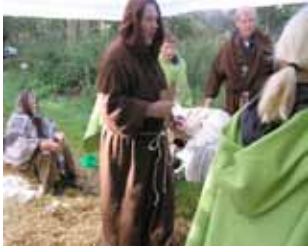
The sick are carried out of the threatened monastery.

Pastor plays the Devil in 2-hour role-play for confirmation classes